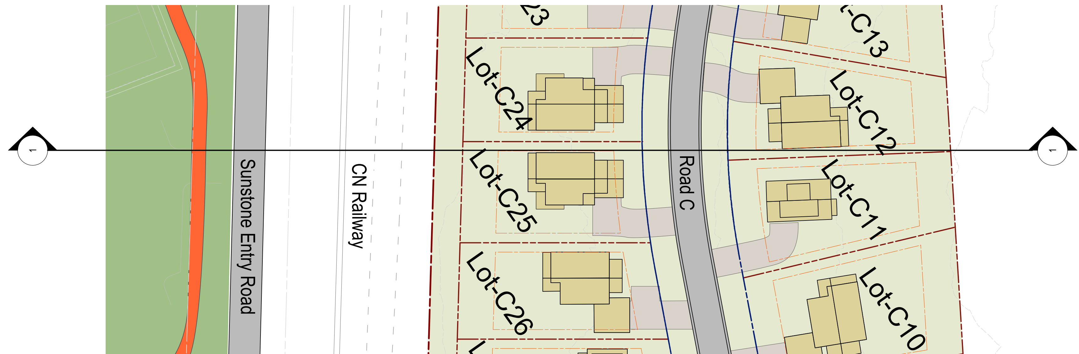
2 Partial Plan Scale: 1:500

Note: This document is general and indicates approximate relationships between existing and proposed conditions. See civil engineering grading plans and undertake site specific surveys to determine individual lot conditions.